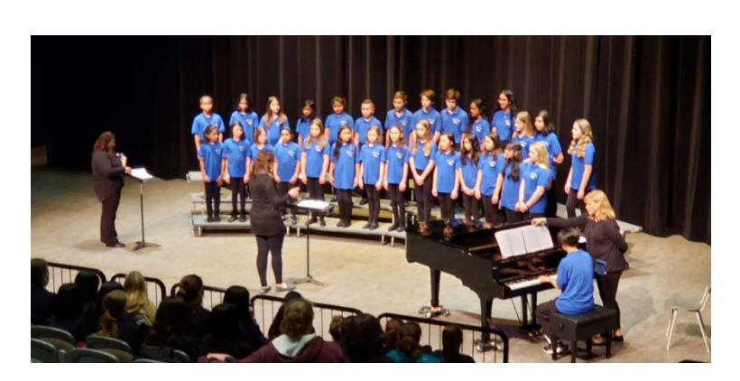
Jr/Int. Choir at Music Alive